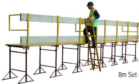
8m Set ( 2 Batten Length ) Illustrated

Set Prices Listed incorporate Quantity Discounts as above (Trestles and Battens NOT included)